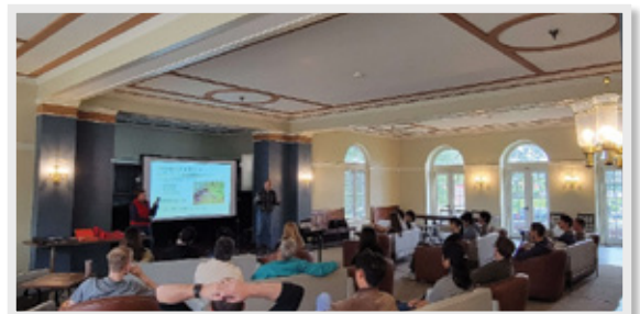
Air Streaming