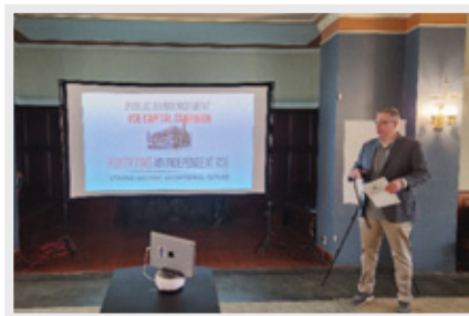
Alumni Weekend