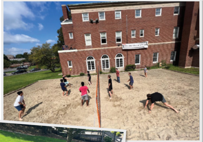
RSEi Welcome Volleyball Event

As more and more students at RPI hear about RSEi, all the members are able to see their hard work finally come to fruition. Even though there is a lot more work to be done for us to achieve our goal, with the committed alumni and students that we have, each day we are getting closer and closer.