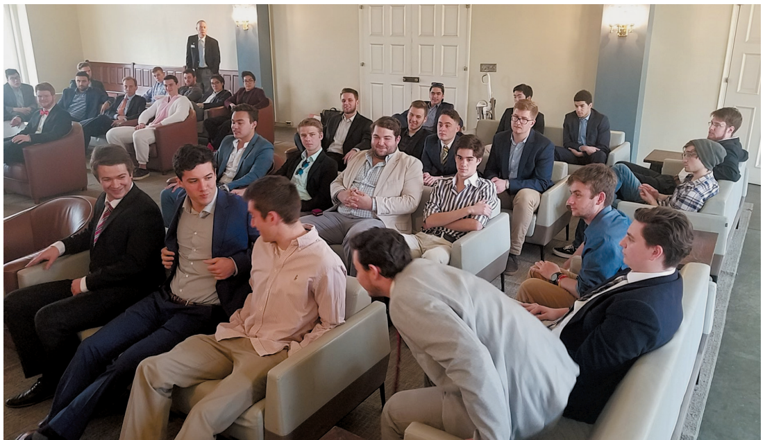
The 2019 Spring Society Meeting

current suspension has given us the time to spend on examining the entire program from a global view. Every event in the program has been directly linked to RSE's core values, is fully documented, and is designed to create a smooth path for the recruits. The Society Meeting began and 3 PM in the Living Room, and was a positive conclusion to the weekend. The Junior Membership is working diligently to return to a recognized status for the Fall Semester, and it is our responsibility as Alumni to aid them. There are multiple ways to help RSE, so please consider contacting us to assist.